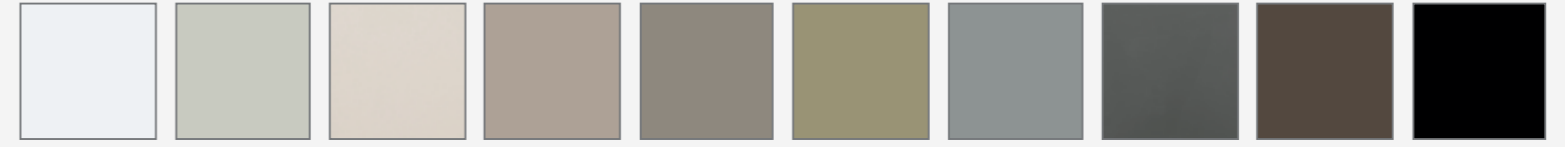
BIANCO PURO PIUMA NEBBIA INCENSO FOSSILE KAKI PLUMBEO GRIGIO FOCA CAFFÈ NERO

Vetro lucido e vetro opaco Glossy glass and matte glass / Verre brillant et verre mat/ Vidrio brillante y vidrio mate